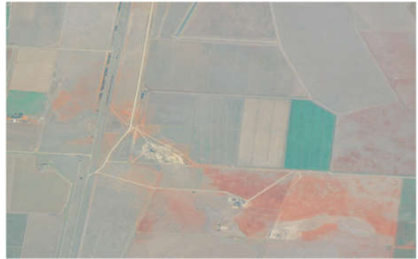
Figure 8C – Historical aerial image c.1996