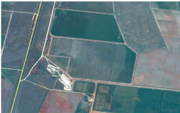
Figure 8E – Historical aerial image c2013 7