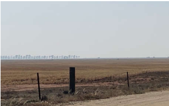
Figure 8A – Looking north-east across Jerilderie Common 5