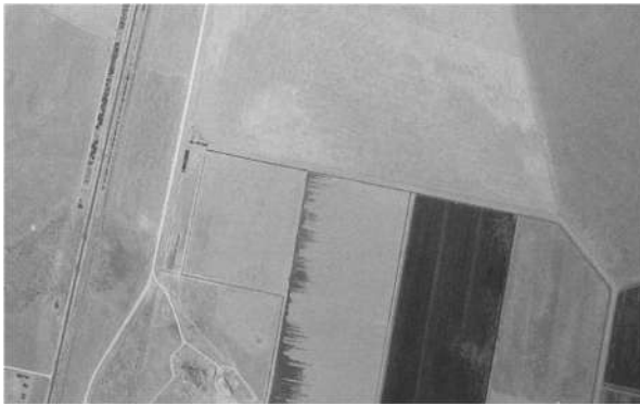
Figure 8C – Historical aerial image c.1976 6