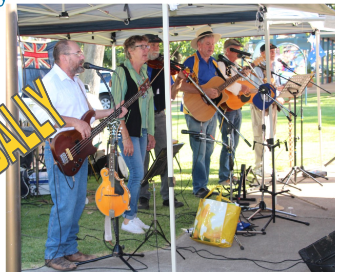
The Swag 'n' Billy Band performing on Australia Day

Recognised for their contributions to our communities: