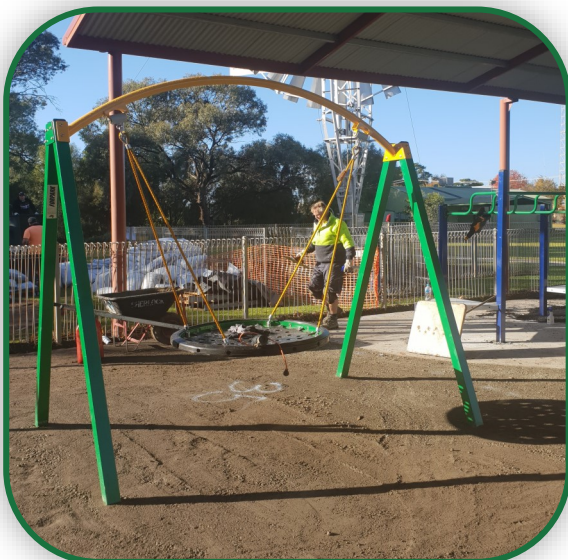
Installation of new playground equipment at Luke Park