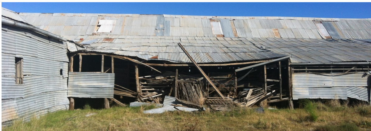
TOGANMAIN COLLAPSED NW WALL APRIL 2016