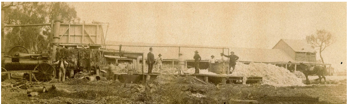
1891 TOGANMAIN SCOURING WORKS (NOW DEMOLISHED)