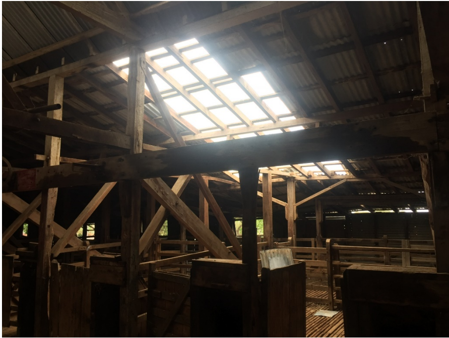
TOGANMAIN MISSING ROOF SHEETING MARCH 2017