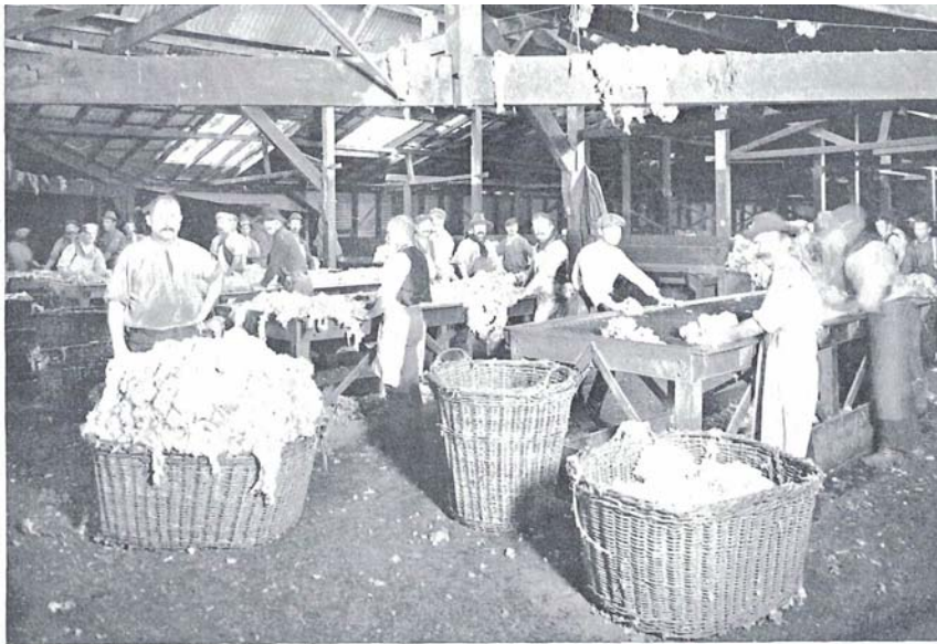
THE TOGANMAIN WOOL ROOM, PASTORAL HOMES OF AUSTRALIA