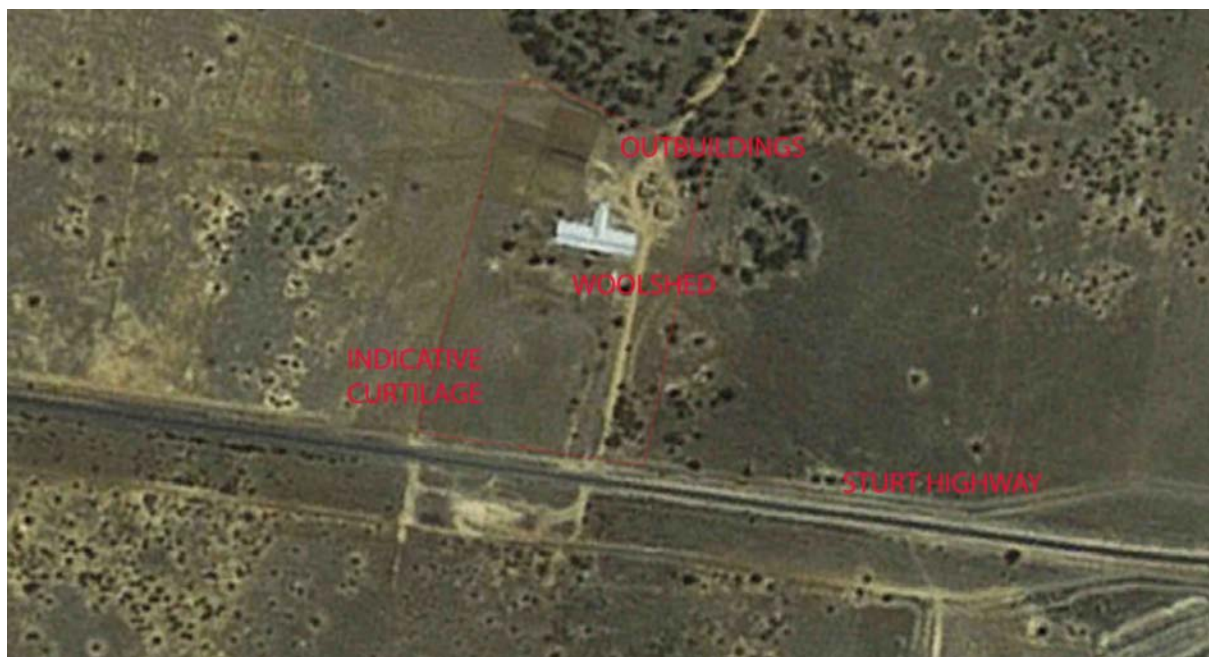
LOCATION OF THE TOGANMAIN WOOLSHED PRECINCT ON THE STURT HIGHWAY: AERIAL VIEW.