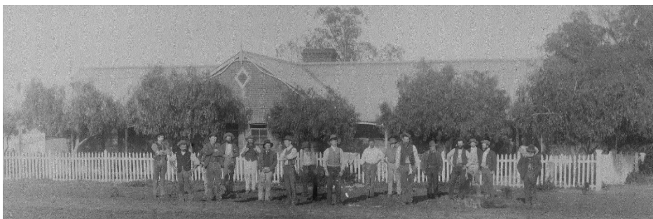
1891 TOGANMAIN MEN'S HUT (NOW DEMOLISHED)