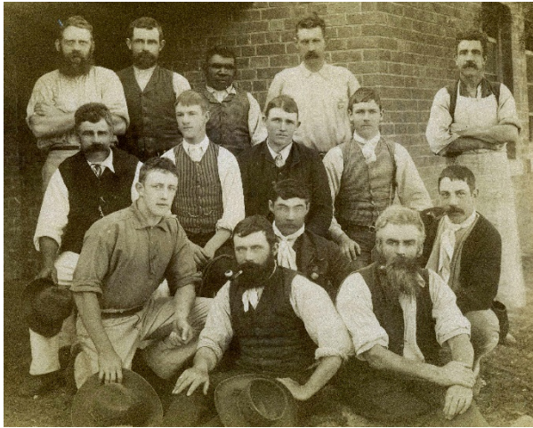
1891 TOGANMAIN WOOLSHED SHEARING HANDS