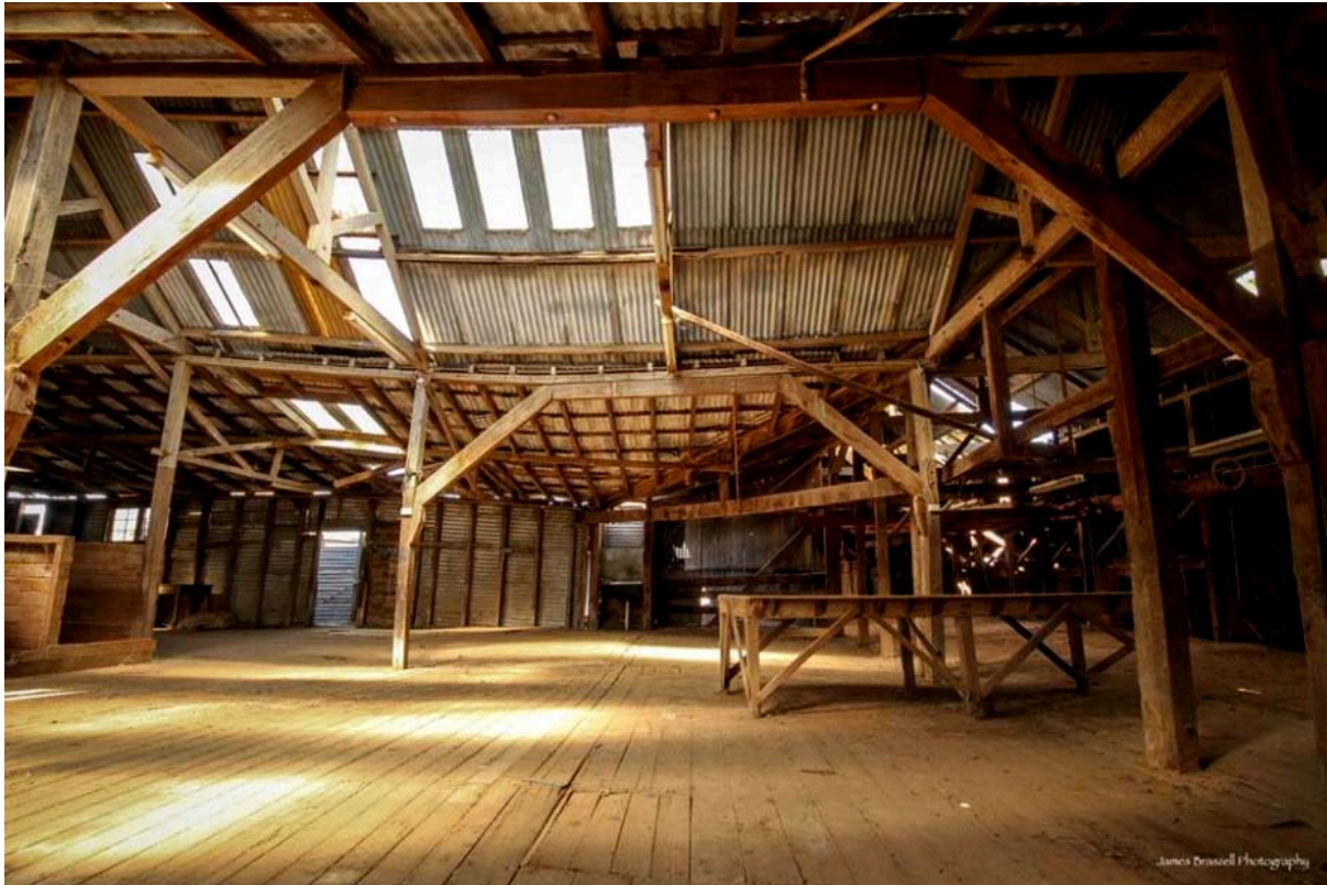
ABOVE: THE TOGANMAIN WOOLSHED WOOLROOM, JAMES BRASZELL 2018 PHOTOGRAPH.

ownership of the land containing the Toganmain Woolshed and associated outbuildings, as well as road access will be gifted to the not-for-profit Toganmain Woolshed Precinct Incorporated.