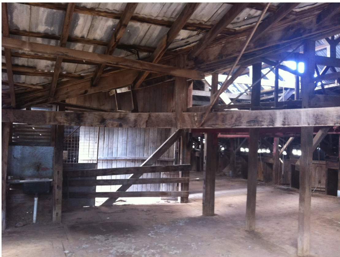
TOGANMAIN DAMAGED BEAMS WOOLROOM APRIL 2016