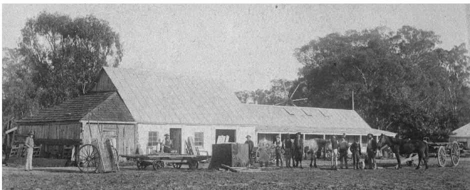
1891 TOGANMAIN BLACKSMITH AND CARPENTRY WORKS (NOW DEMOLISHED)