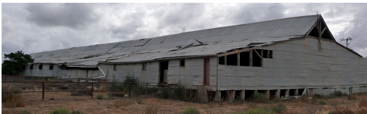
TOGANMAIN DAMAGED SE CORNER APRIL 2016