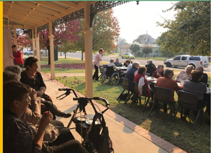
Afternoon tea on the lawns at the rear of the Library