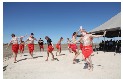
Above: the boys from Tirkandi Inaburra performing a welcome dance at the opening of at the Coleambally Solar Farm.