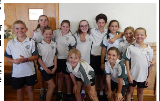
The St Joseph's 5/6 students did a great job serving