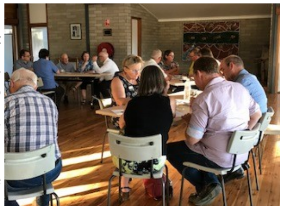
Members of the community attending a CSP session at Coleambally

A CSP meeting is scheduled with the community at Waddi Housing Corporation on the 6 April 2018.