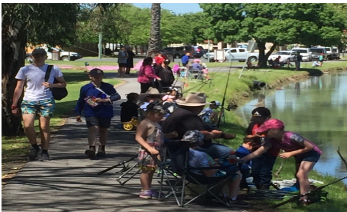
Locals enjoying the annual Children's Fishing Competition at the Jerilderie Lake