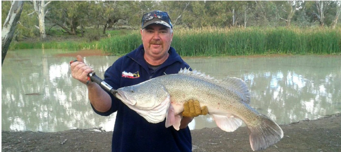
Fishing Club member with a mighty catch from the Billabong Creek