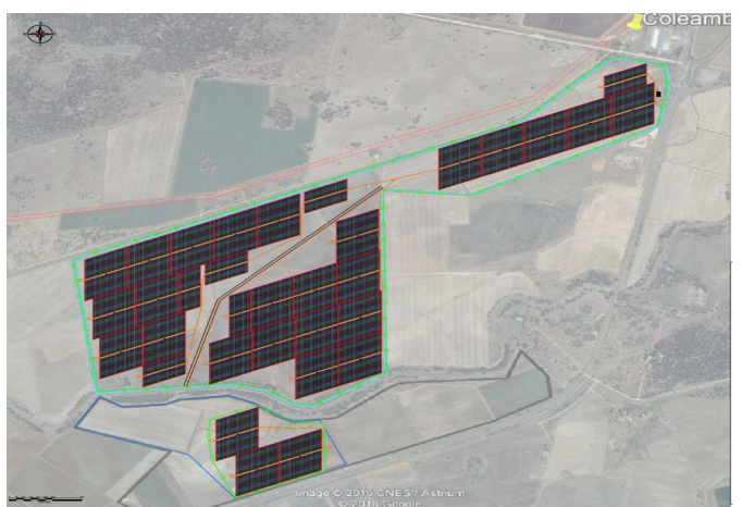
Site plan of the 150 MW Coleambally Solar Farm

The solar farm will generate approximately 380,000 MWh of clean, renewable electricity into the national power grid each year, abating about 300,000 tonnes of carbon emissions annually (equivalent to removing 90,000 cars or planting 530,000 trees) and making a major contribution to Australia's greenhouse gas emissions reduction. It is expected to generate enough electricity to power more than 50,000 homes, and has contracted 70 per cent of its output to Energy Australia.