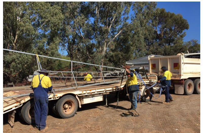
The historic windmill being transported to its new home.