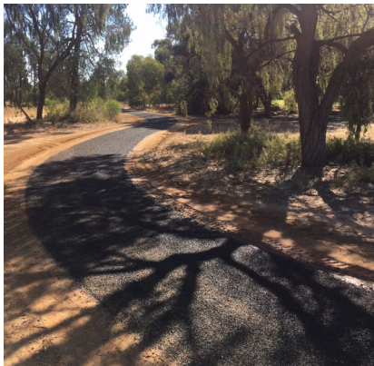
The new Coleambally walking track spans 1.2km.

Consultants have been engaged to produce a concept plan for the Brolga Place upgrade and Sportsground Masterplan, watch this space!