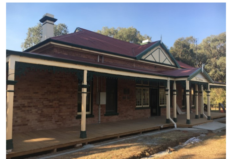
The Willows repairs were funded by a Heritage Near Me Grant from State Government, owners of the building.

Works are almost complete at The Willows with the brickwork and verandah works completed last month and paving and painting works scheduled to finish early May.