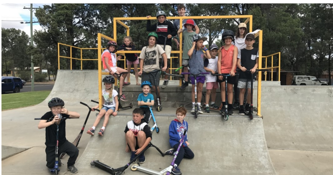
Local children at the Coleambally Skate Park event

Winners of the Skate Park Competitions can be found on our Facebook page and website.