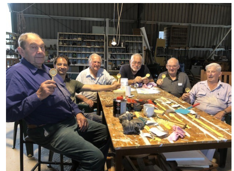
Wood Carving Workshop at the Coleambally Men's Shed