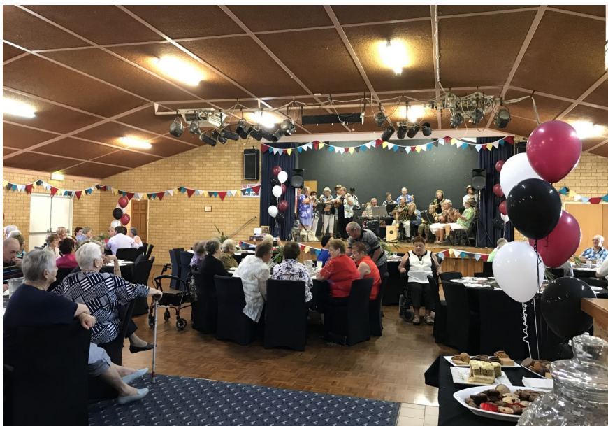
Residents enjoying a musical piece from the "Mugs" and local Ukulele group.