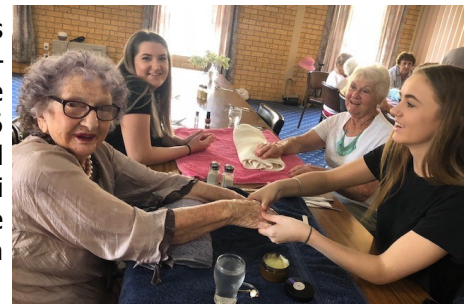
A pamper session at the Hand Massage & Pretty Nails Workshop