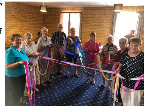
Wellbeing for All Workshop