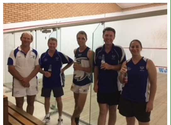
Hay and Coleambally players socialising after an inter-town competition

The Coleambally squash courts were recently renovated after CSC was successful during Round 1 of Murrumbidgee Council's Stronger Communities Fund.