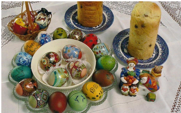
A table set for Easter in the Russian tradition.