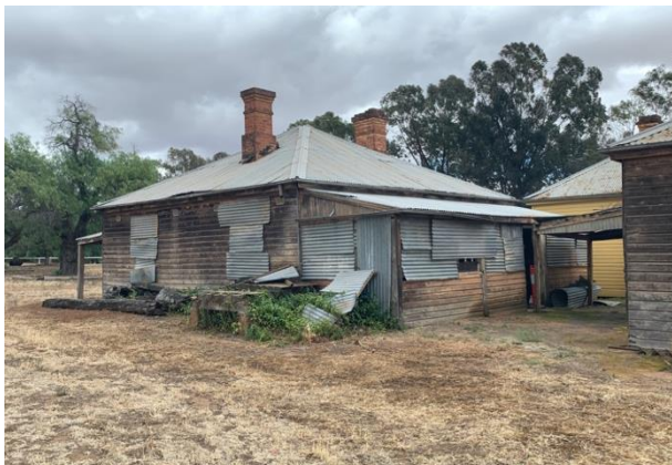
Figure 3G – Other buildings