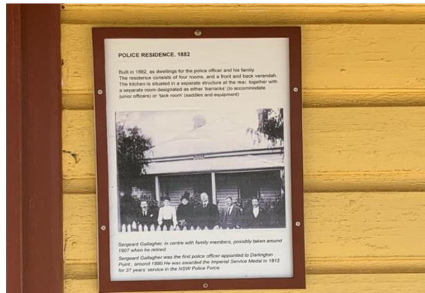
Figure 3D – Plaque