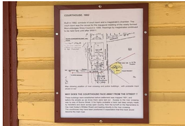
Figure 3F – Plaque