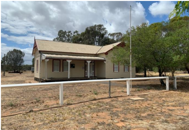
Figure 3A – Former Council Building 4