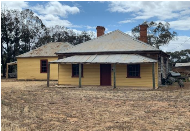
Figure 3C – Former police residence