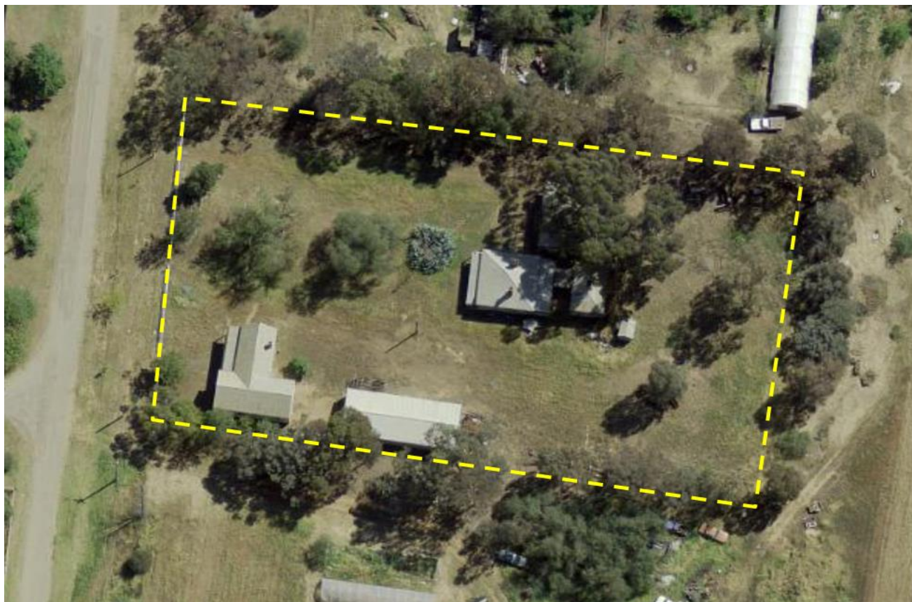
Figure 1: Aerial Image of Darlington Point Museum