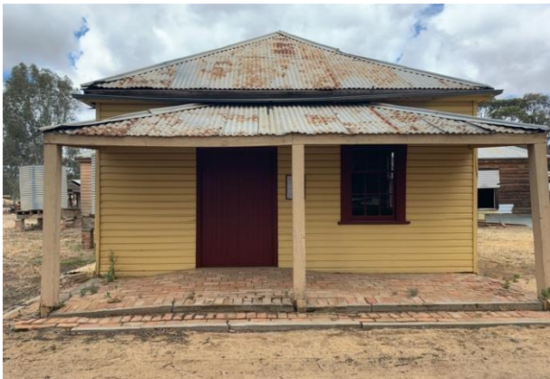
Figure 3E – Former court house