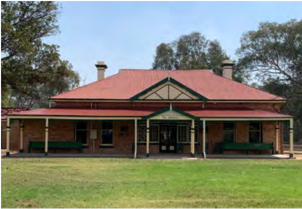
Figure 2A – Existing building (street) 4