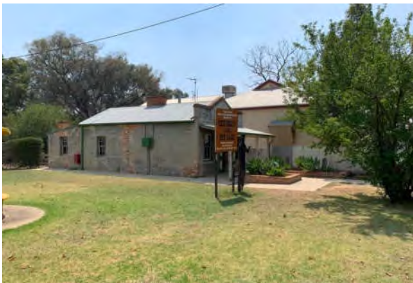
Figure 2C – Existing buildings