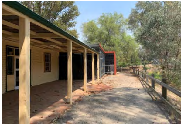
Figure 2B – Existing building (rear)