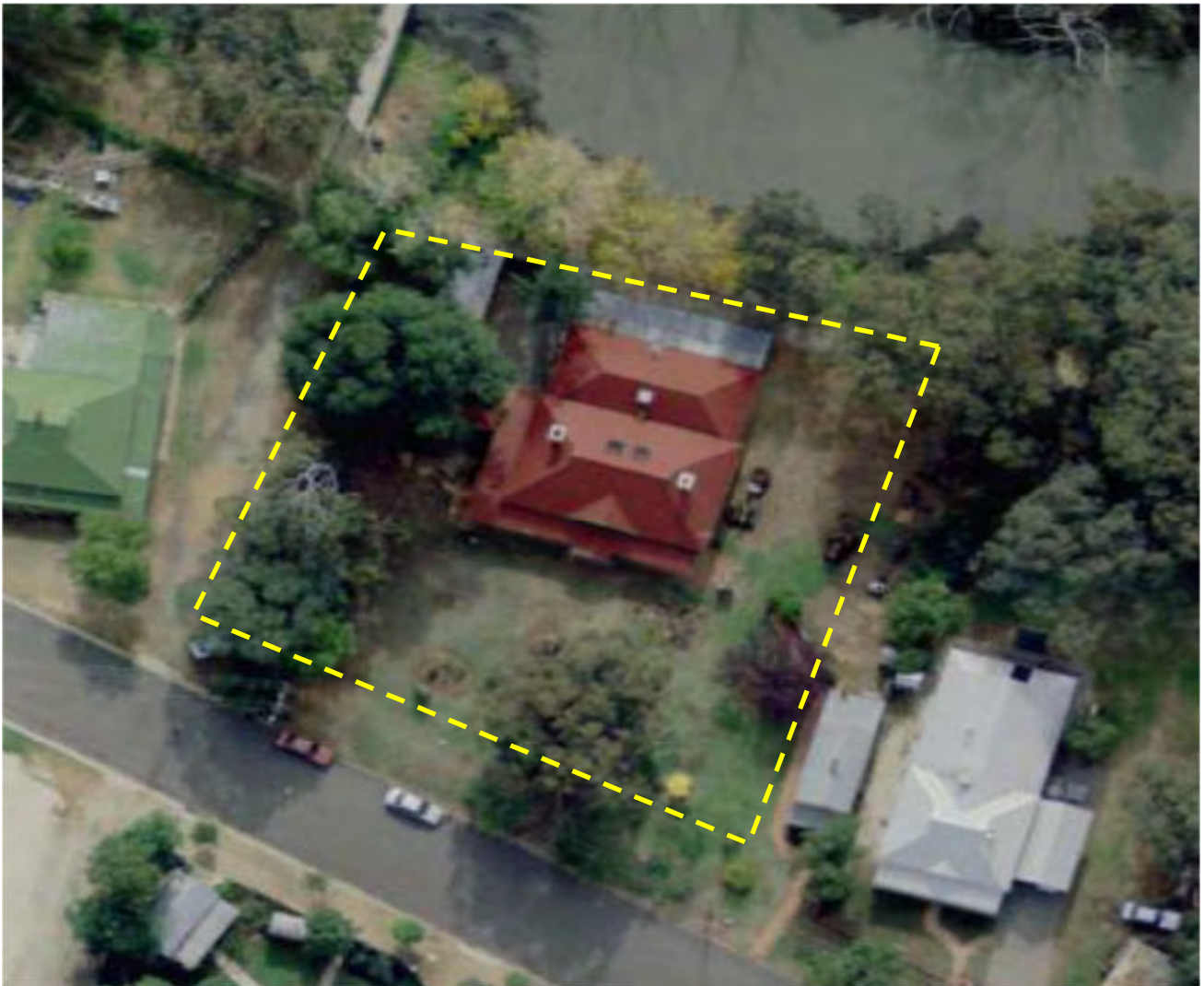
Table 2: Area of cultural significance not covered by this plan of management