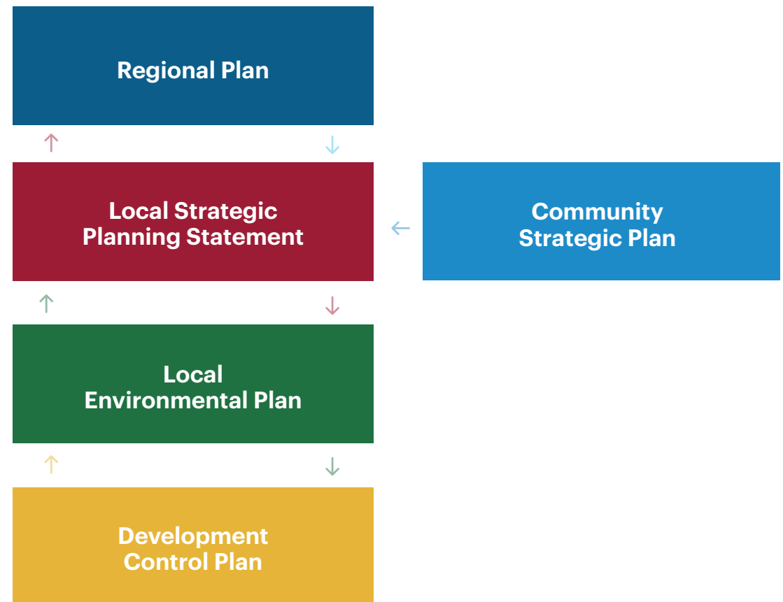
Figure 1 Relationship between LSPS and other planning influences

More information on local strategic planning statements can be obtained at — planningportal.nsw.gov.au/publications/local-strategic-planning-statements