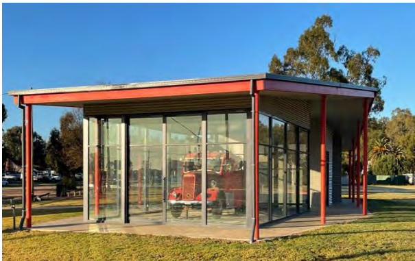
Figure 12 – Display & amenities building