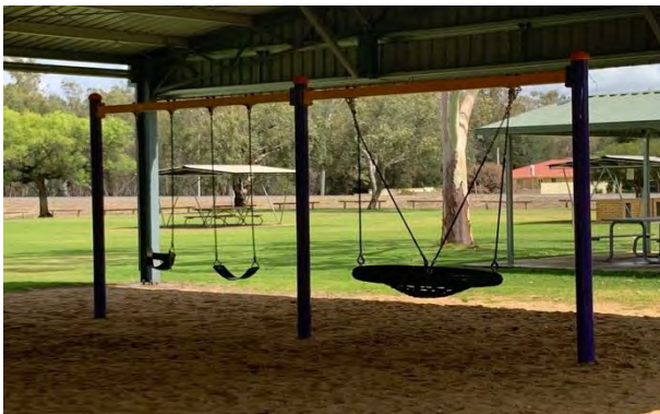
Figure 8 – Existing newer style swings