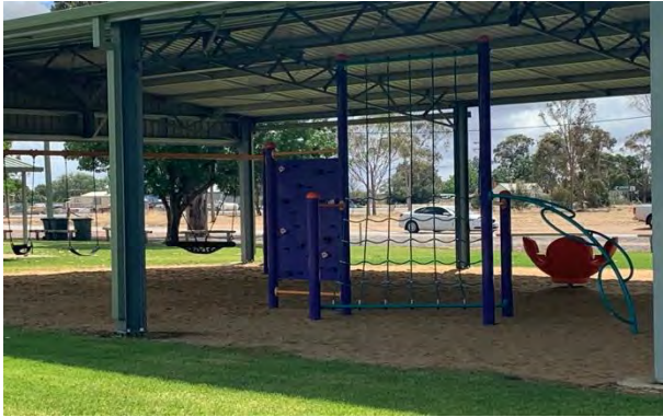
Figure 10 – Existing climbing equipment