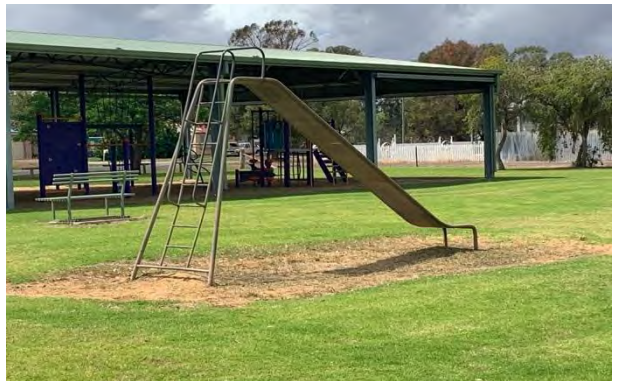
Figure 7 – Existing older style slippery dip