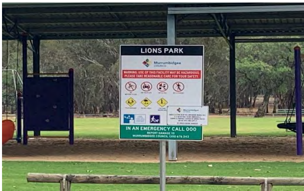
Figure 2 - Signage 4