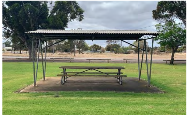
Figure 5 – Picnic table and shelter