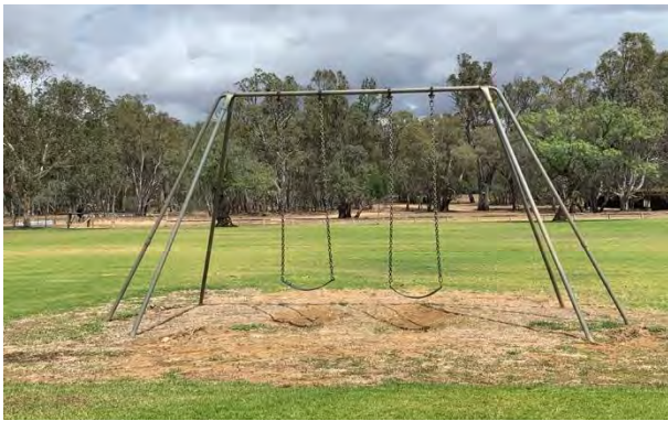
Figure 6 - Existing older style swings