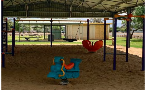
Figure 11 – Existing play equipment