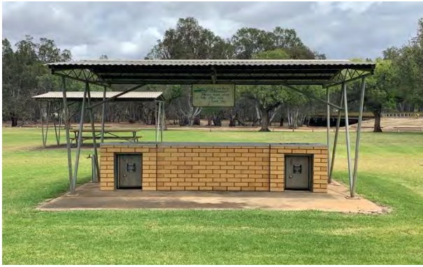
Figure 4 – BBQ facilities