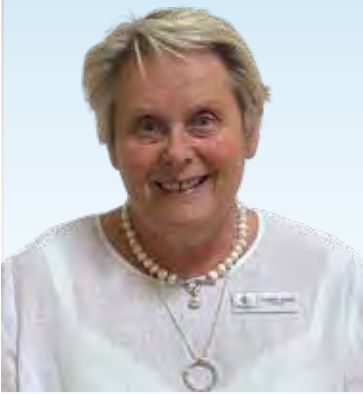
Ruth McRae Mayor