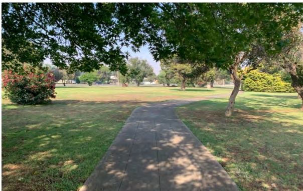
Figure 8C - Central part of Elliott Park