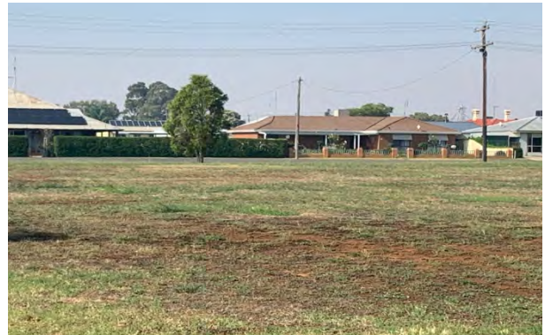
Figure 8B - North-eastern part of Elliott Park