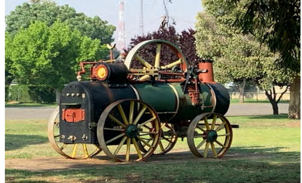
Figure 8F - Old steam powered machinery