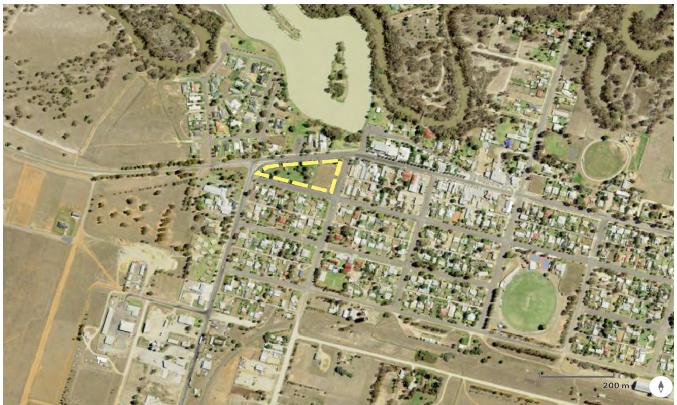
Figure 2A – Location of Elliott Park 2

Elliott Park, highlighted in Figure A on page 8, is a small area of public open space located in the western part of the town. It comprises an area of approximately 11,190m 2 and is bounded by Newell Highway (A39) to the west, Jerilderie Street (part of the A39) to the north, Kennedy Street to the east and Mahonga Street to the south. The reserve is located within easy walking access from the commercial centre, which includes the Murrumbidgee Council administration building, a number of food and drink premises, motels and hotels.