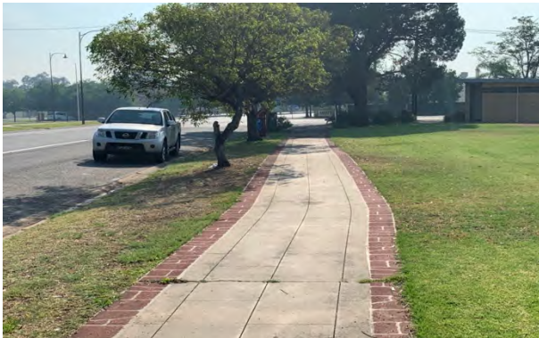
Figure 8G - Footpath adjacent to north of park