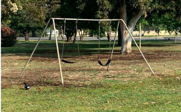
Figure 8E - Existing swings