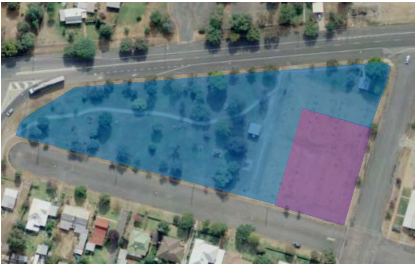
Figure 2B – Local Government Act categorisations within Elliott Park

The residue of Elliott Park (blue in Figure B below), being an irregular shape has an area of 8640m 2 , will continue to be used as open space for passive outdoor recreation.