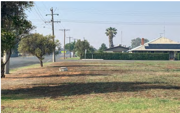
Figure 8A - Eastern part of Elliott Park 4