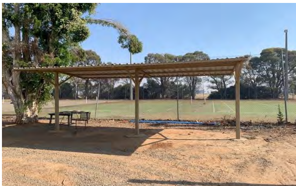
Figure 8 – Picnic shelter and tennis courts