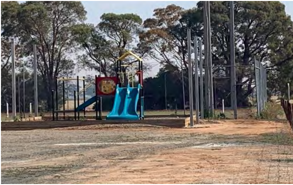
Figure 9 – Playground equipment