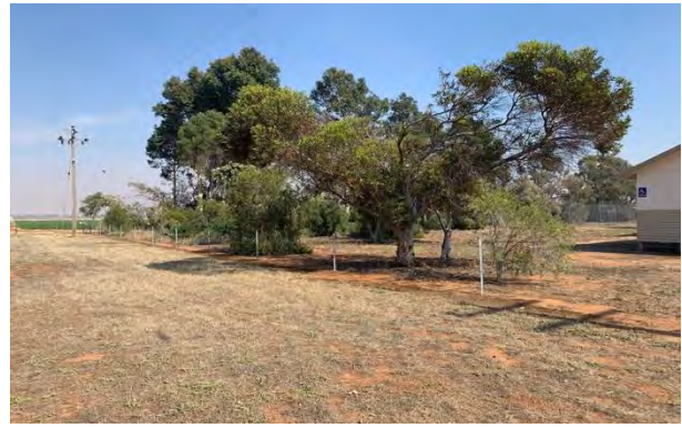
Figure 5 – Entrance fencing and vegetation