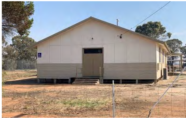
Figure 6 – Front elevation of hall