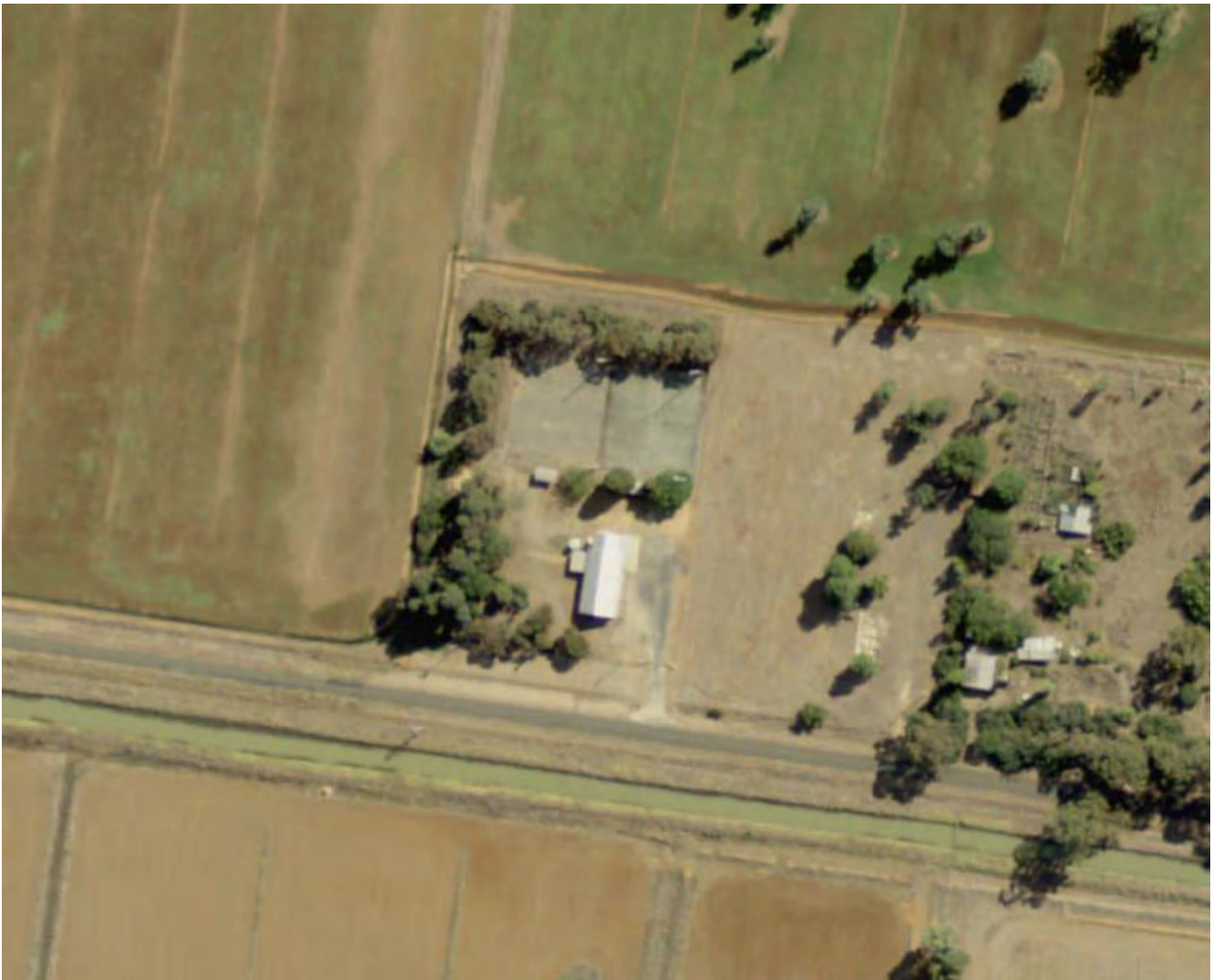
Figure 1 – Location of Coree Central Hall 1

Coree Central Hall provides the local community a public hall and open space for the purpose of passive outdoor recreation, including synthetic tennis courts, basketball courts and playground equipment. Landscaping largely comprises of planted and remnant vegetation planted along the western and northern perimeter of the site.