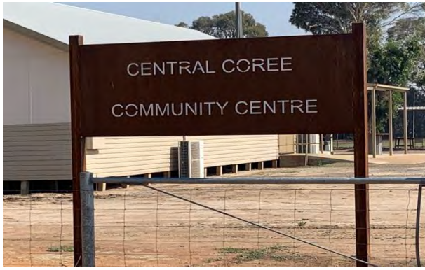
Figure 4 – Entrance sign