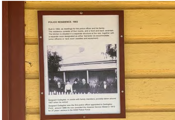
Figure 3D – Plaque