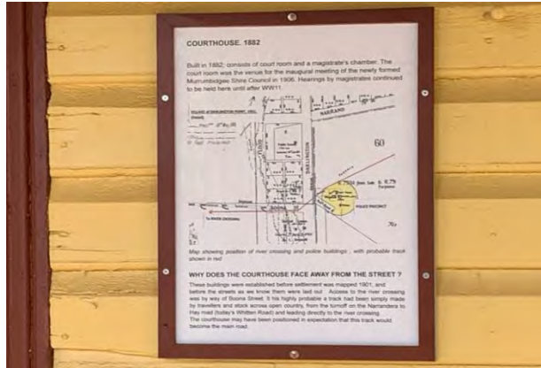
Figure 3F – Plaque