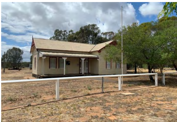
Figure 3A – Former Council Building 4