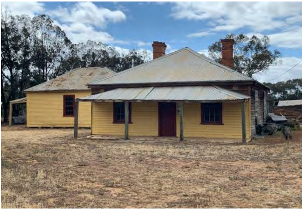
Figure 3C – Former police residence