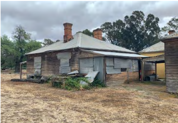
Figure 3G – Other buildings