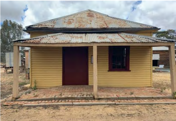
Figure 3E – Former court house