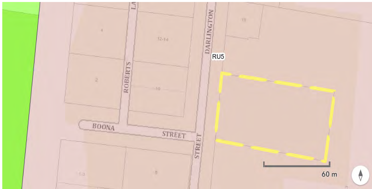
Figure 2: Extract from MLEP 2013 Zoning Map

pens; Moorings; Open cut mining; Pond-based aquaculture Rural industries; Rural workers' dwellings; Waste disposal facilities; Wharf or boating facilities