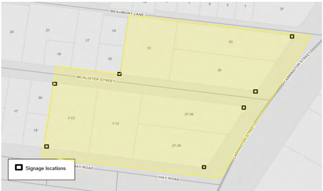
Figure 2: Darlington Point Alcohol free zone signed areas. (Yellow indicates public roads, footpaths and areas included)