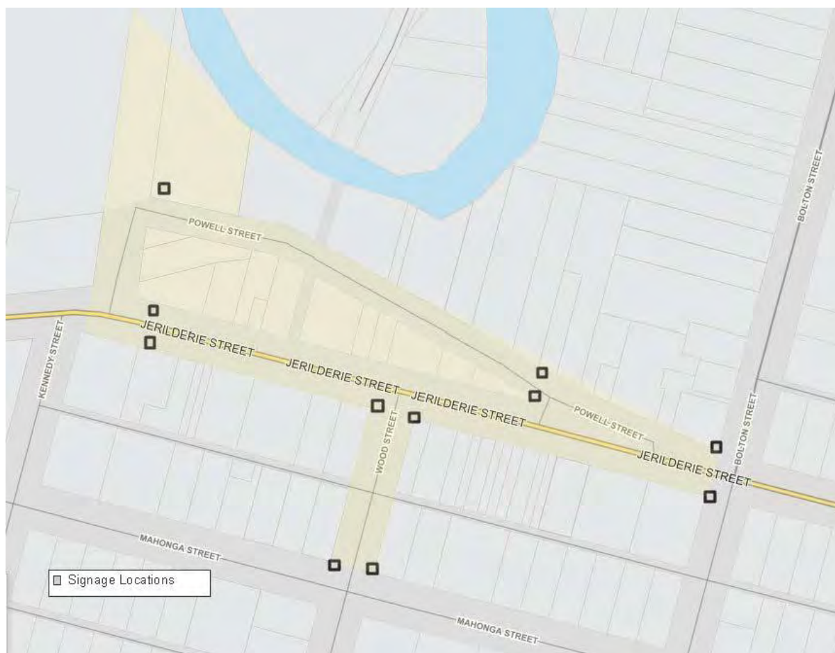
Figure 1: Jerilderie Alcohol free zone signed areas. (Yellow indicates public roads, footpaths and areas included)