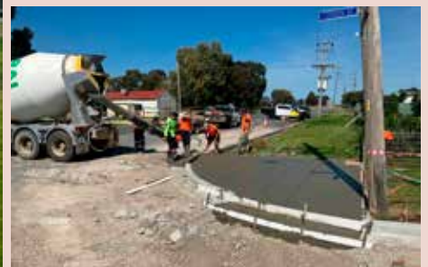
Coreen Street Kerb Removal and Replacement