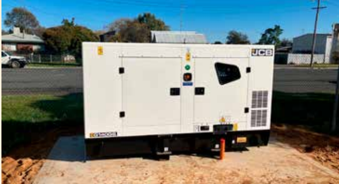
Monash Park Electrical Upgrade