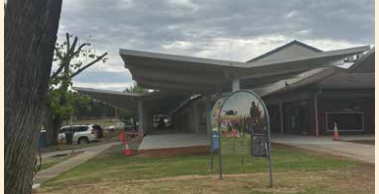
Brolga Place Upgrade of Pedestrian Area and Shade Structure