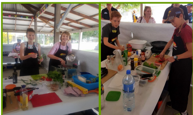
Locals show off their cooking skills during the festival.

Congratulations to the hard-working Taste Coleambally Food and Farm Festival Committee for their fantastic three-day event showcasing all things Coleambally.