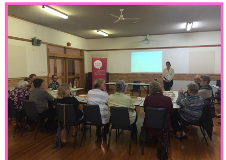
Jerilderie Stakeholder Session