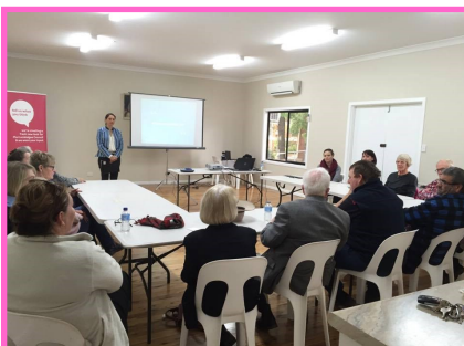
Darlington Point Stakeholder Session