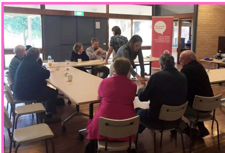
Coleambally Stakeholder Session